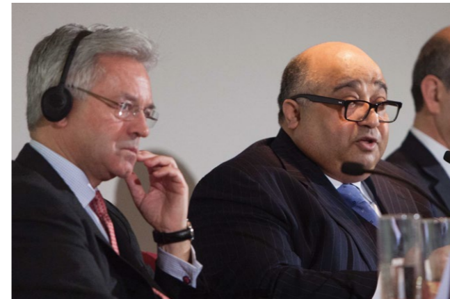
Sir Alan Duncan & HE Sheikh Mohamed Bin Issa Al Jaber