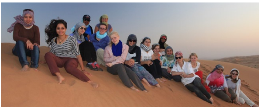
Participants from the January 2012 journey take a break from dialogue to pose in the desert in Oman

The focus of the MBI Al Jaber Foundation's project department is on educational and cultural projects, and we concentrate on forging partnerships rather than simply giving grants. We strive to create an environment in which we can bring people together in the name of greater understanding and awareness of one another's cultures.