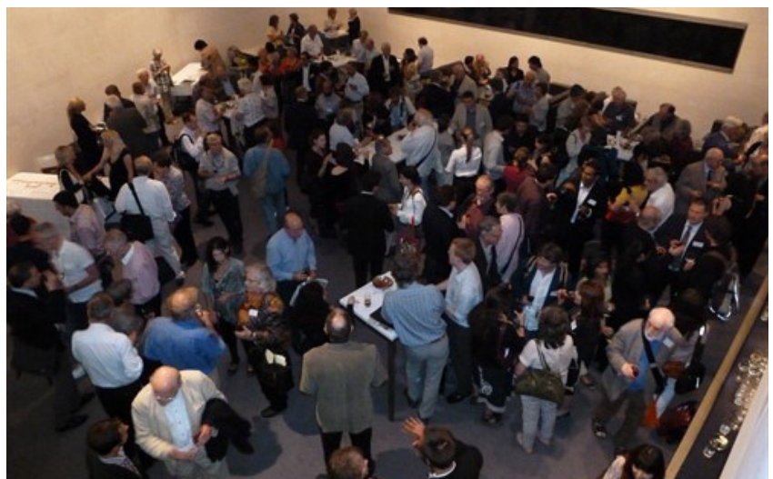
Guests mingle at the reception following the MBI Al Jaber Lecture on 28 July 2011

The MBI Al Jaber Foundation once again sponsored the Seminar for Arabian Studies which was held at The British Museum in London from Thursday 28th – Saturday 30th July 2011.