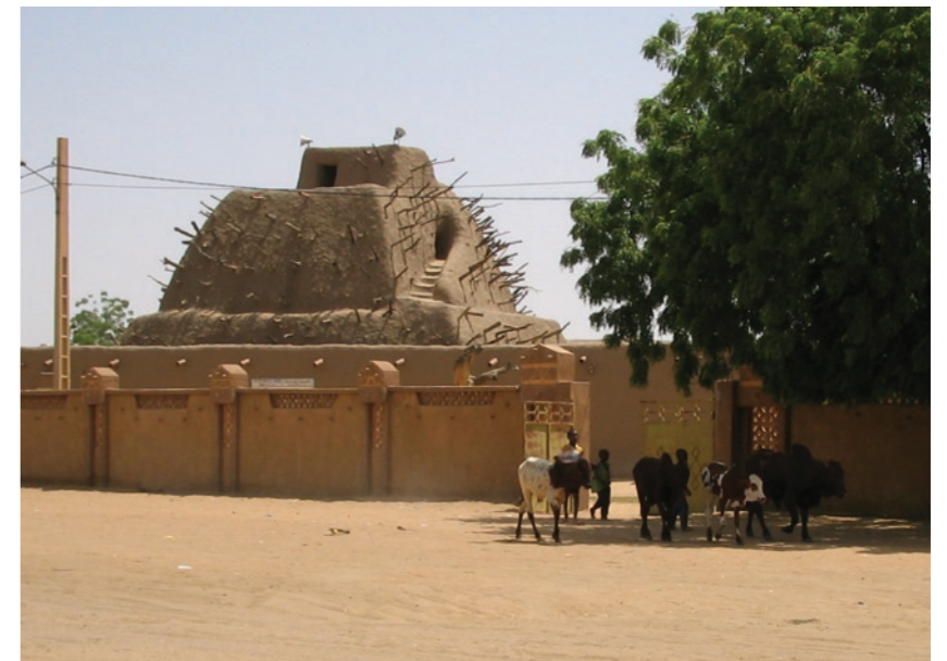
Tomb of Askia, Gao

The Foundation supports an international meeting of experts to discuss the safeguarding of Mali's cultural heritage.